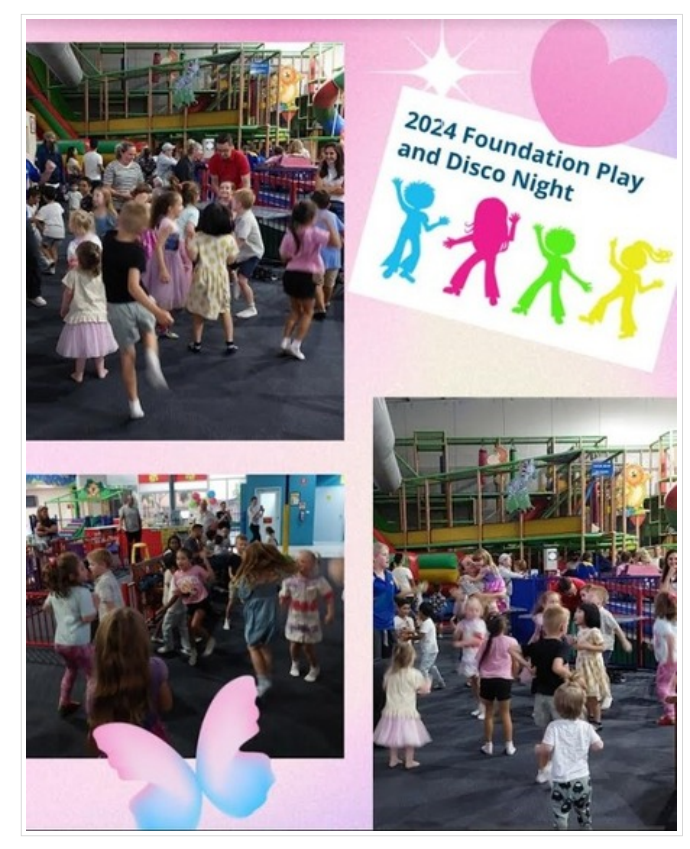
• Foundation Play and Disco Night

Last Friday, 23rd February, we held the Foundation Play & Disco night at Lollipops Playland. Over 100 children and 80 parents attended which made for a very fun and enjoyable evening. Parents had a chance to catch up and get to know each other while the Foundation students had a great time playing and dancing with their friends.